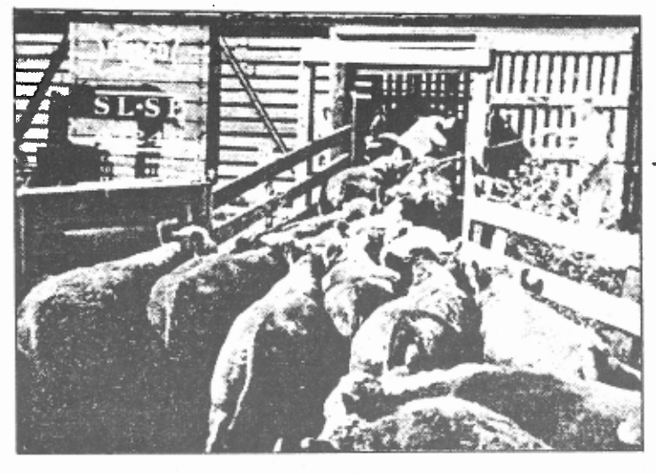
Alan Schmitt Collection

According to William E. Bain, in his book FRISCO FOLKS (1961), the Frisco set a rail industry record in 1912. On January 2, 1912, train No. 832 with engine No. 987 providing the power pulled into St. Louis with the longest stock train on record to that date. The train's consist included thirty-eight cars of hogs, twenty-two cars of cattle, and one car of sheep; a total of sixty-one cars and 1,840 tons of livestock. The record breaking load required a helper engine, No. 982, to assist it over the hills between Crystal City and St. Louis.