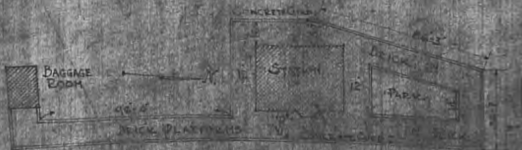
PLOT PLAN SCALE 1/8" = 1'-0"