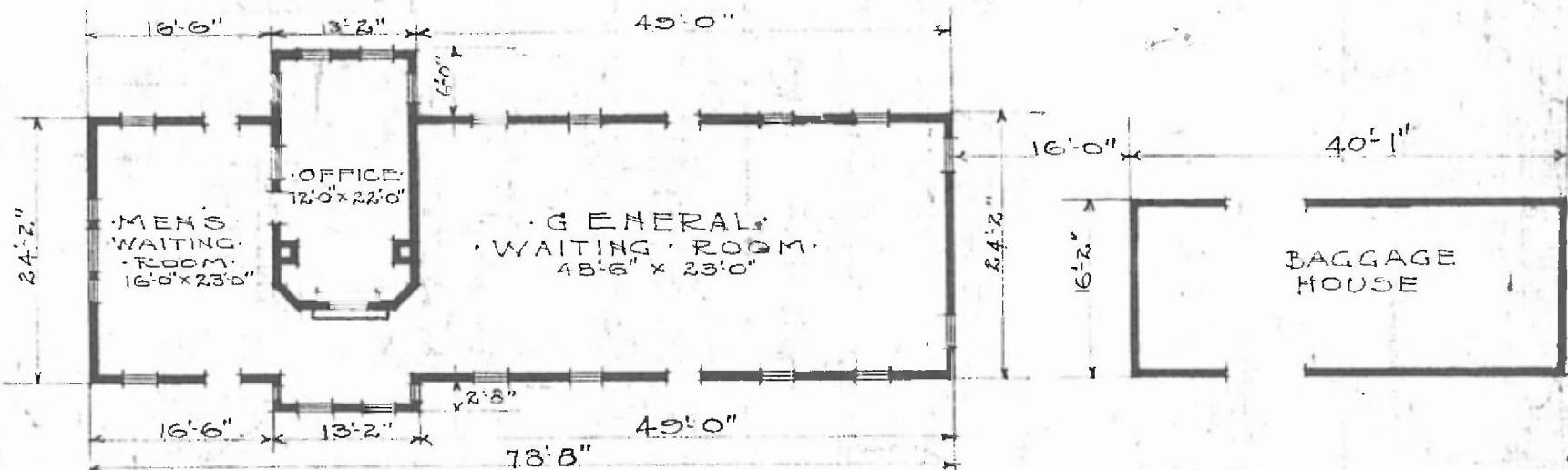
FLOOR PLAN. SCALE 1/16" = 1'-0"

FLOOR FINISH { INSIDE: 1/8" x 3/4" Y.P. STAYO L-154 OUTSIDE: CEILING HEIGHT. 13'-0". LIGHTING. ELECTRIC 2 WIRE 110 A.C. SANITARY FACILITIES. OUTSIDE TOILETS.