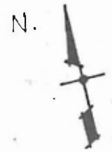
FLOOR PLAN SCALE \frac{1}{16} " = 1'-0"